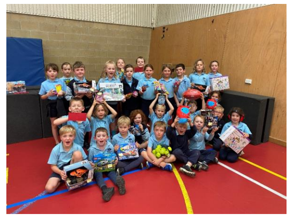
Reception to Year 1 Fun Run prize winners

Students who earned $100 or over in the Fun Run were acknowledged and received a gift at the Week 6 assembly. Thank you to everyone who contributed to this fundraising event, which raised over $9000. Governing Council and the fundraising committee will make decisions in consultation with school staff and students, as to how the money will be spent. Thank you to all of the volunteers who supported the organisation and running of the Fun Run.