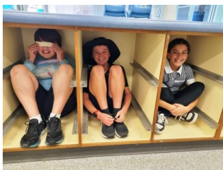
Rostered Year 5 & 6 students enjoying their time in the Canteen.